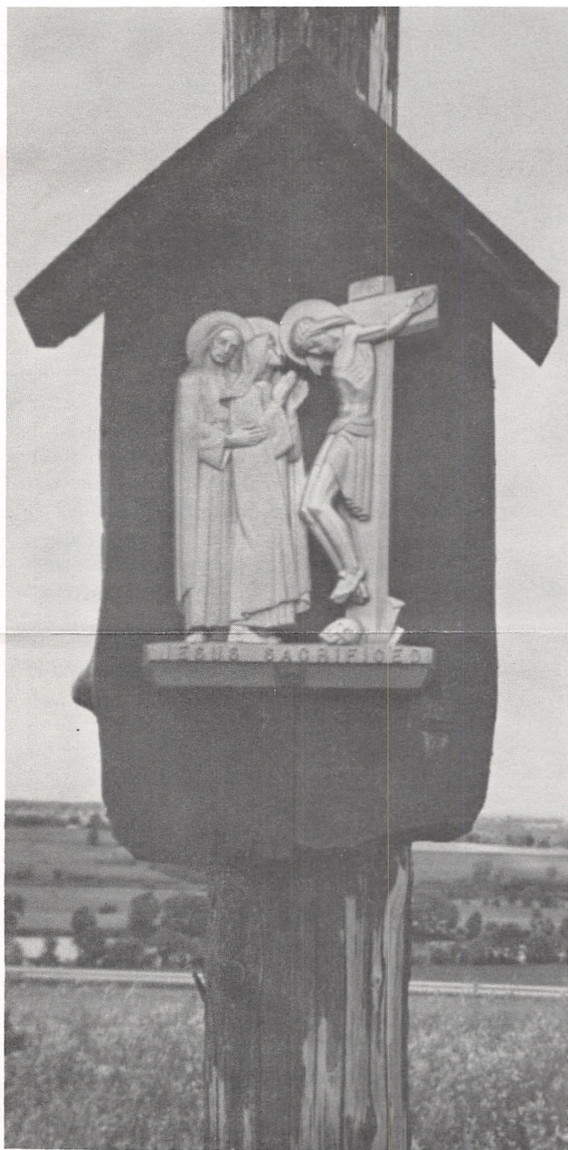
Twelfth Station on the Esplanade with Mohawk Valley in the background.