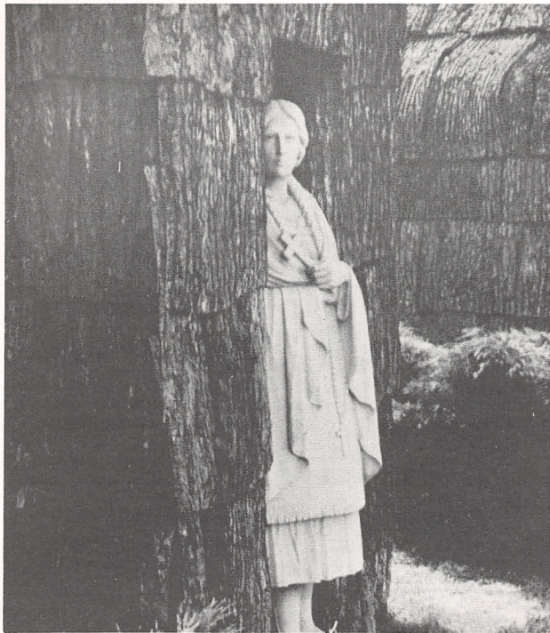
Kateri, Lily of the Mohawks, for whose beatification we devoutly pray in 1976, the Semicentennial of her baptism and the Bicentennial of our nation.