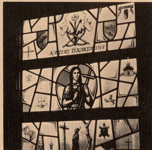
The newest representation of the Lily of the Mohawks (1966) in the stained-glass window of the Chapel of the Jesuit Martyrs of New York State, Residence of the Buffalo Provincial, Syracuse, N.Y.

THE LATEST PORTRAIT OF KATERI: One of the four stained-glass windows in the Jesuit Community Chapel at Syracuse, N.Y. (see below) honors Kateri, placing her in pride of place among the three Jesuit Martyrs of Auriesville where she was born. This colorful view shows her surrounded by her typical symbols: the lamp and lily symbolizing her vow of virginity; the cross, chalice and host, her love for the passion, the Eucharist and the Church; the turtle, her Indian clan; and her relics in the Church at Caughnawaga.