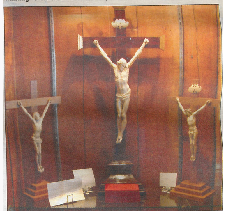
This is the glass case where Kateri's relics were on display at the St. Francis Xavier Mission.