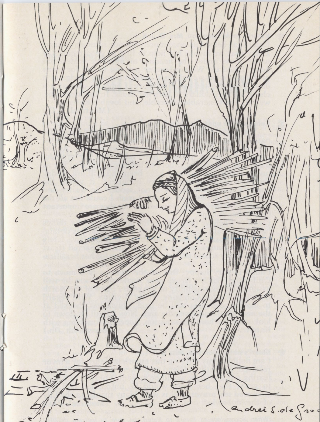
"Her companions were not slow to find in her a model of humility, devotion, sweetness, charity, and of the other Christian virtues."

"Since that time I can say I have found nothing in her in which she would seem to have relaxed in the slightest from her first fervor." Indeed, the effects of the sacrament of Baptism in Kateri were exactly those the Holy Father expects of today's baptized Christians.