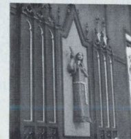
The new statue of Kateri at the Martyrs' Shrine, Midland, Ont.