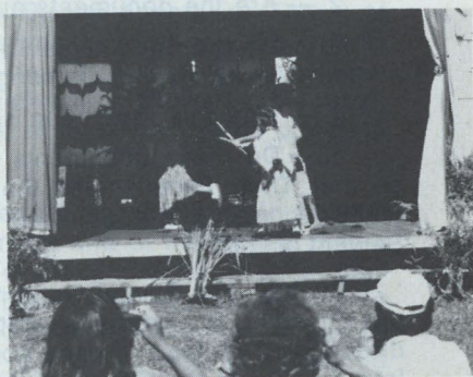
She is persecuted as a Christian.