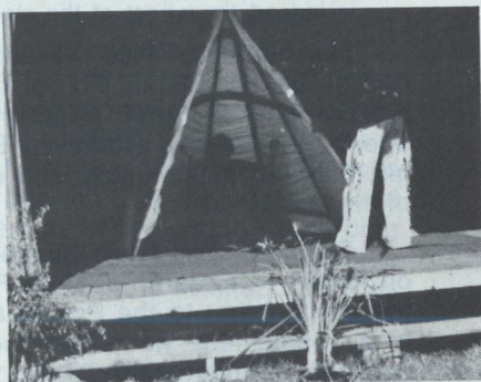
She is threatened for her faith.