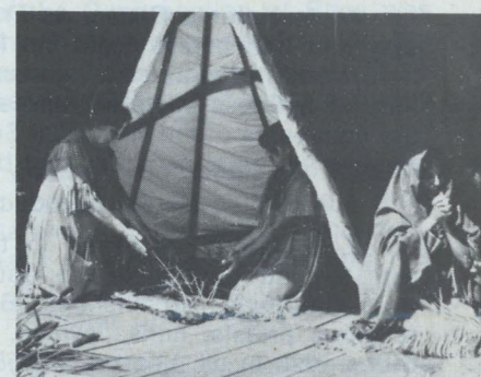
In a spirit of penance, she strews her bed with sharp thorns.