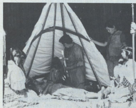
Her saintly death.