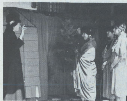
She thinks of founding a religious community.