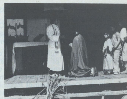
Her First Communion.