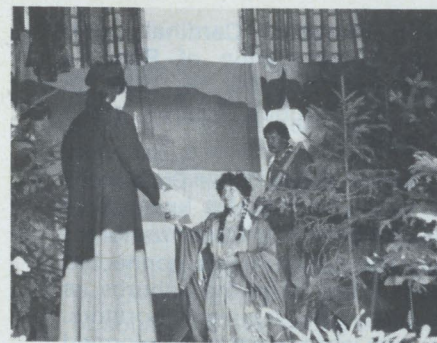
Kateri escapes to Kahnawake.