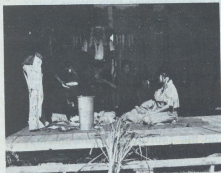
Kateri refuses to marry.