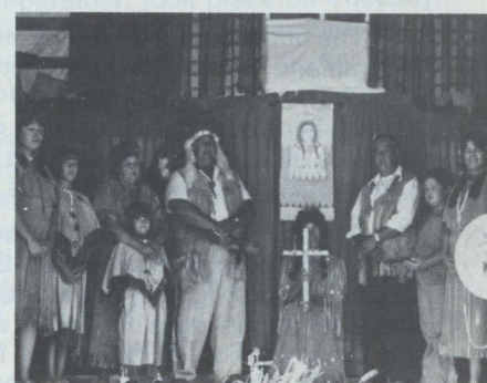
Kateri is declared Blessed in heaven.