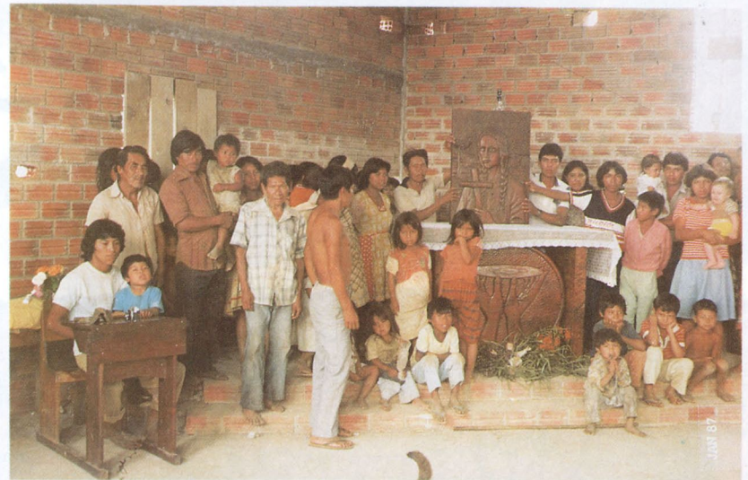
The unfinished chapel dedicated to Blessed Kateri Tekakwitha and the carved wooden altar surrounded by native parishioners, December 1986.