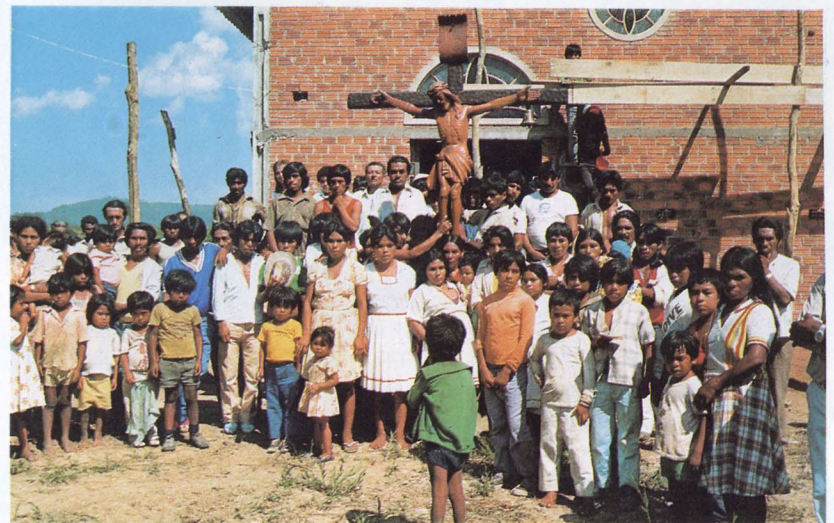
Indians gathered together before the Blessed Kateri Tekakwitha Chapel, Holy Keek 1987