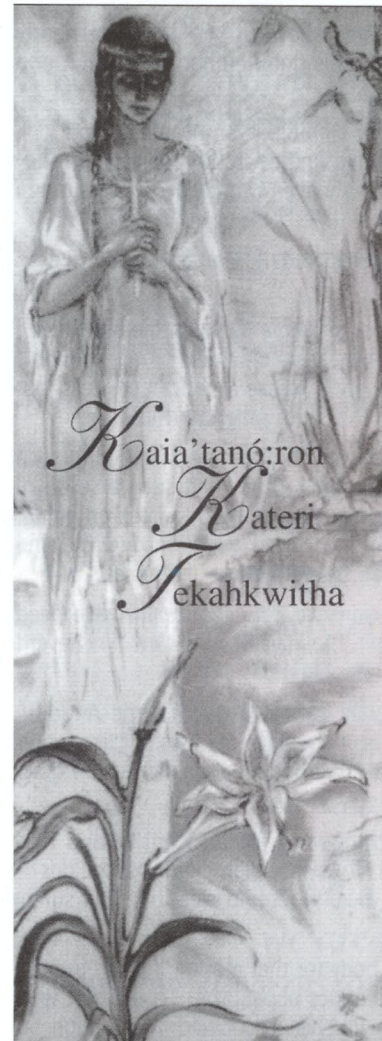
Kaia'tanó:ron Kateri Tekahkwitha

"It was in 1973, near the end. Our team was in Cambodia on a reconnaissance mission. We weren't supposed to be there according to the rules, but it was necessary in a war that had no rules.