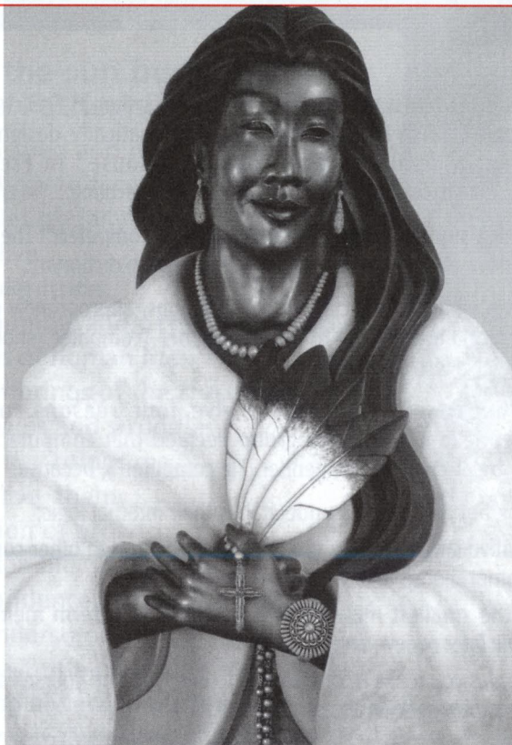
Prayer for the Lily of the Mohawks Kateri Tekakwitha

Who died at age 24, the first Native American to be declared blessed