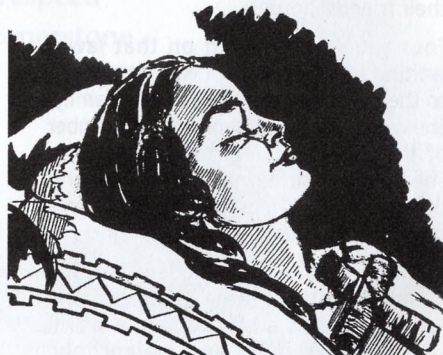
"It was impossible to cover her face as they took so much pleasure in seeing her."

Sometime after three quarters of an hour after three o'clock, "Then her face had suddenly changed, which appeared such smiling and devout that everyone was extremely astonished - her face that had changed gradually in less than a quarter of an hour. Because of smallpox that her face was ruined from the age of four, which her infirmities and mortification had contributed to ruin her even more. The face of Kateri was such marked and having a darken complexion, which her face had suddenly changed about a quarter of an hour after her death and became in a moment such beautiful, smiling and white. Her face assumed an appearance of a rosy colour, which she never had and her features were not the same. Her face appeared more beautiful then when she had been living. I will admit openly of the first thought that came to me, which Kateri might have entered into Heaven at that moment. Then reflected back in her chaste body a small ray of the glory that she had gone to possess. This blessed soul had left her virgin body to go with her beloved Spouse. And was to celebrate in Heaven with Him the triumphs of the Cross, which she had much loved and attached her heart, affections, chaste and virgin body through this life of mortification. Kateri Tekakwitha had died as she lived, that is to say, as a Saint. Because it was to be expected that such a Holy a Life, which would be followed with a most Holy Death. "