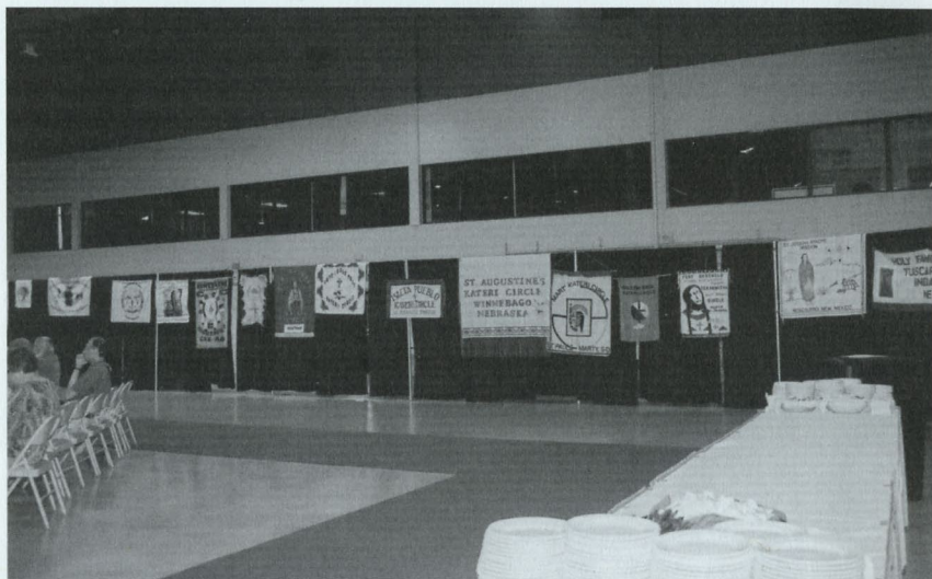
Banners from Kateri Circles from Canada and the United States