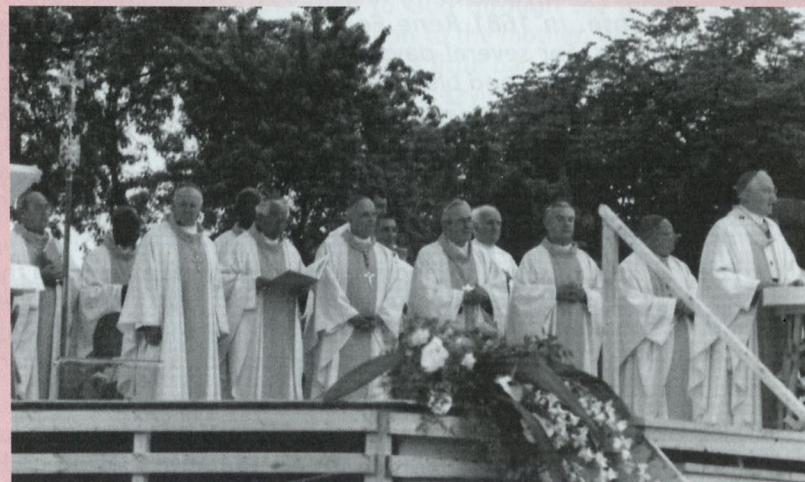
Cardinal Jozef Tomko at the closing Statio Orbis Mass