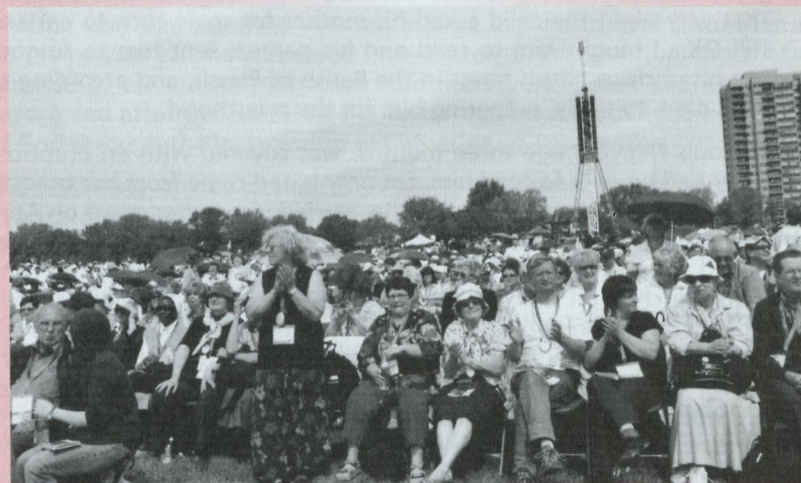
Pilgrims at the closing Mass