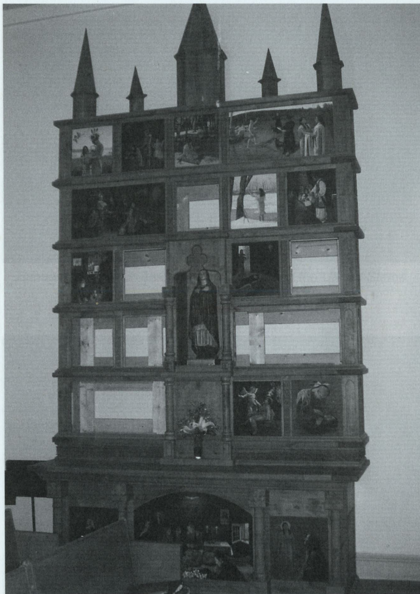
Kateri Tekakwitha Altar Screen