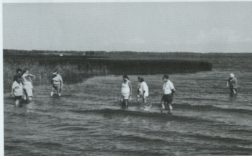
Cleaning at Lac Ste Anne