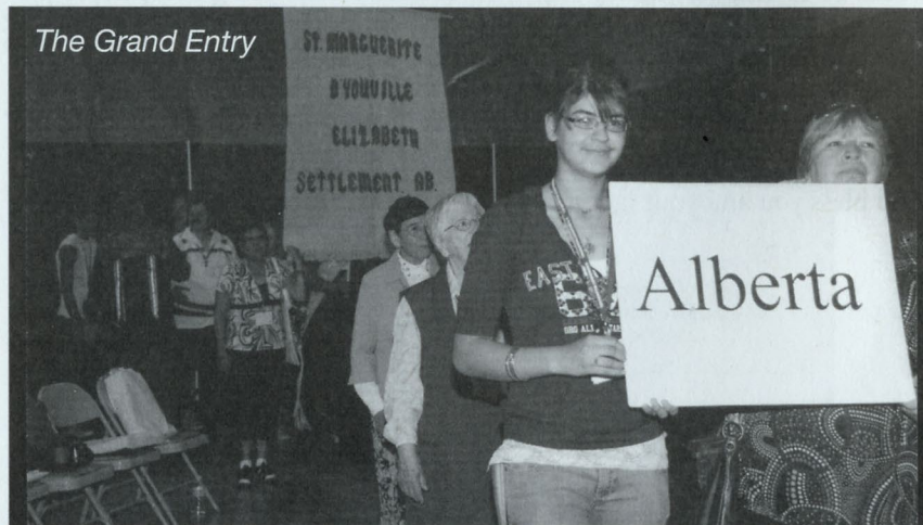
The Grand Entry