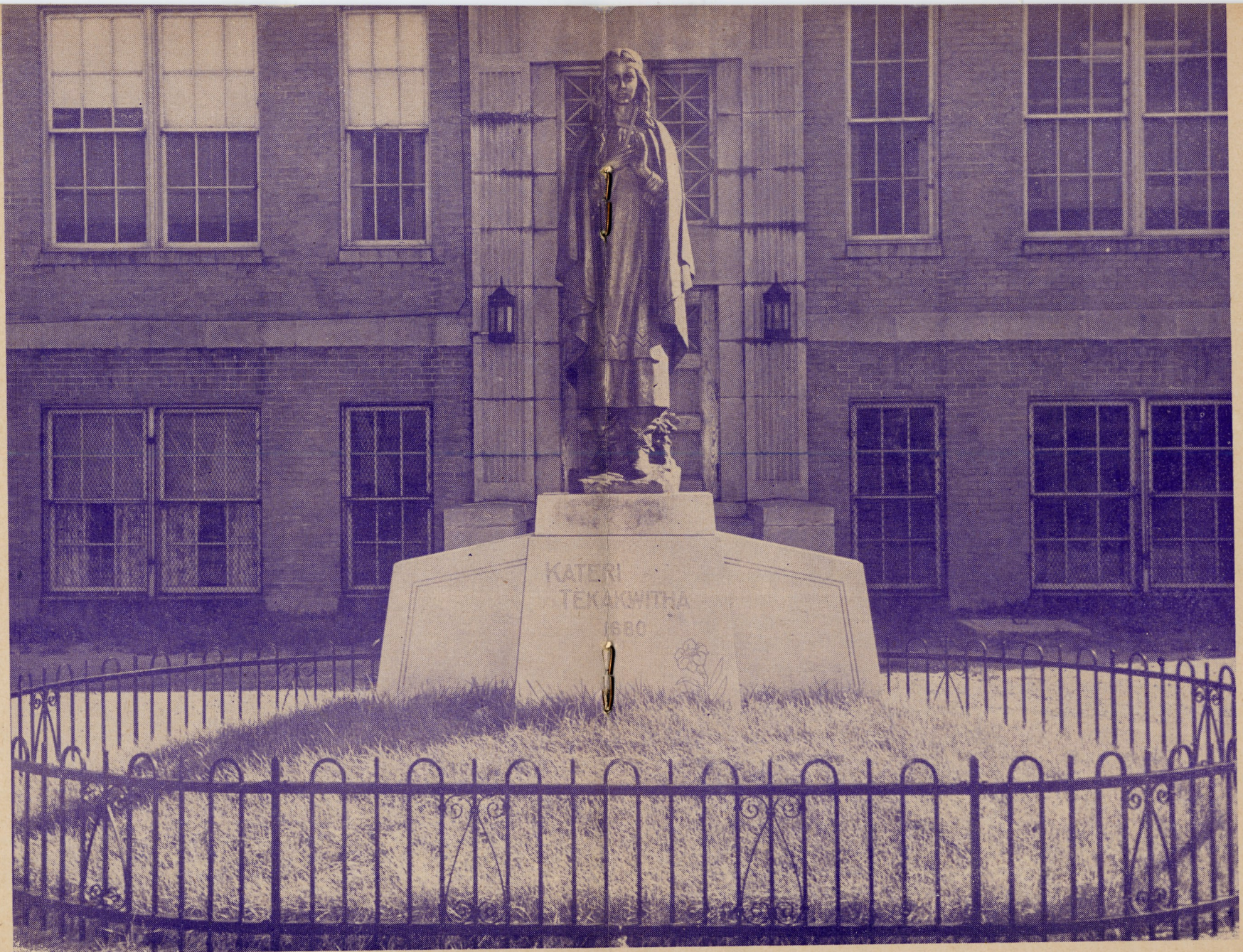
Emile BRUNET, Sculptor