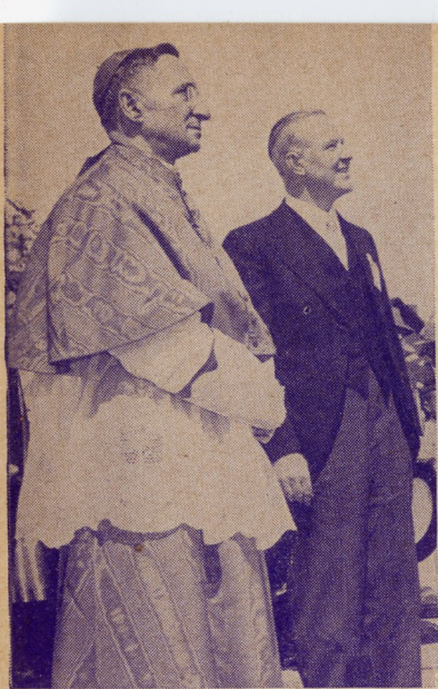
The Apostolic Delegate and the Postmaster General.