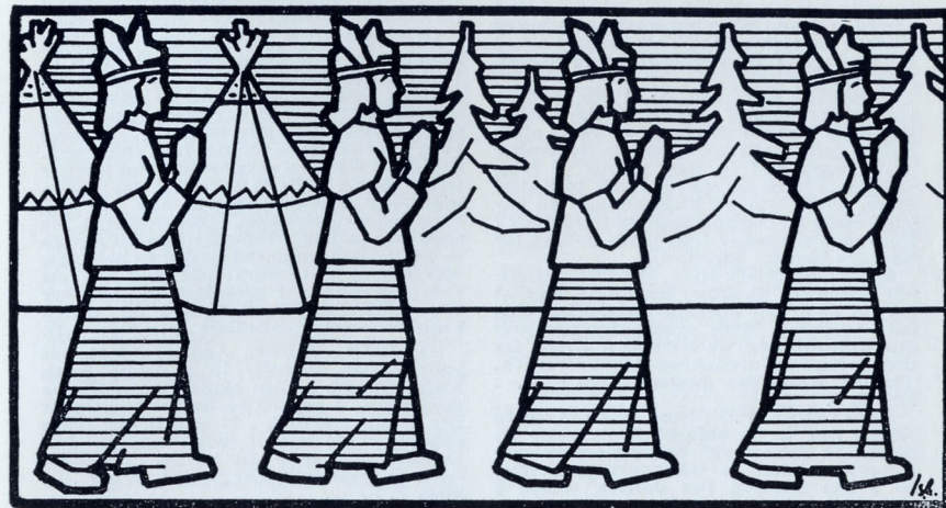
They know their duties so well there is never any disorder . . .

Indians had not yet been seen instructing one another so successfully as we have seen them here. The missionaries are already beginning to have to teach too many people who at first find these customs so new. It was necessary to show them how to make even the smallest inclinations which are made on entering or leaving the church, before or after having taken Holy Water, to rise for the Gospel, to kneel in church. God raised up this year a number of persons who themselves took care of this and who, also, taught catechism to the children and to the newcomers. Here they are well worth many missionaries, because, having thoroughly understood our mysteries, they express them in their own language with an admirable eloquence which results in the ignorant understanding them immediately and being touched by them. When it is known that the newcomers are put up in certain lodges, the missionaries are not worried about their instructions, for entire nights are taken up instructing them. (To be continued.)