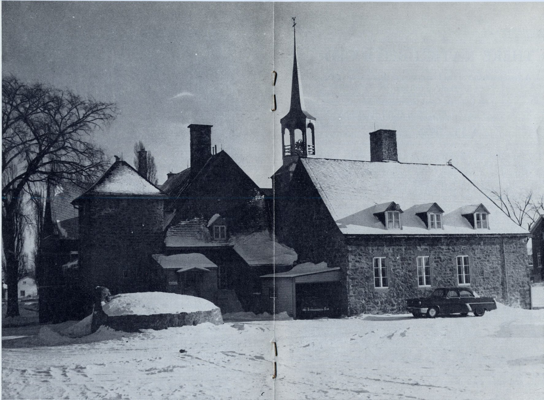
ARRERIA / ARRERIA HAPPY EASTER FROM KATERI'S MISSION !