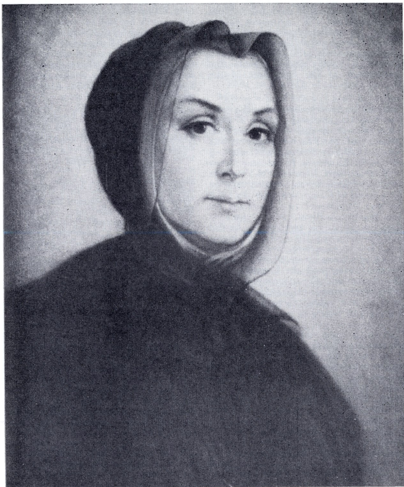
BLESSED MARGUERITE D'YOUVILLE