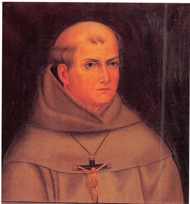
Retrato del Rev. Padre Fray Junipero Serra, Apostol de la Alta California, tomado del original que se conserva en su Convento de la Santa Cruz de Querétaro.