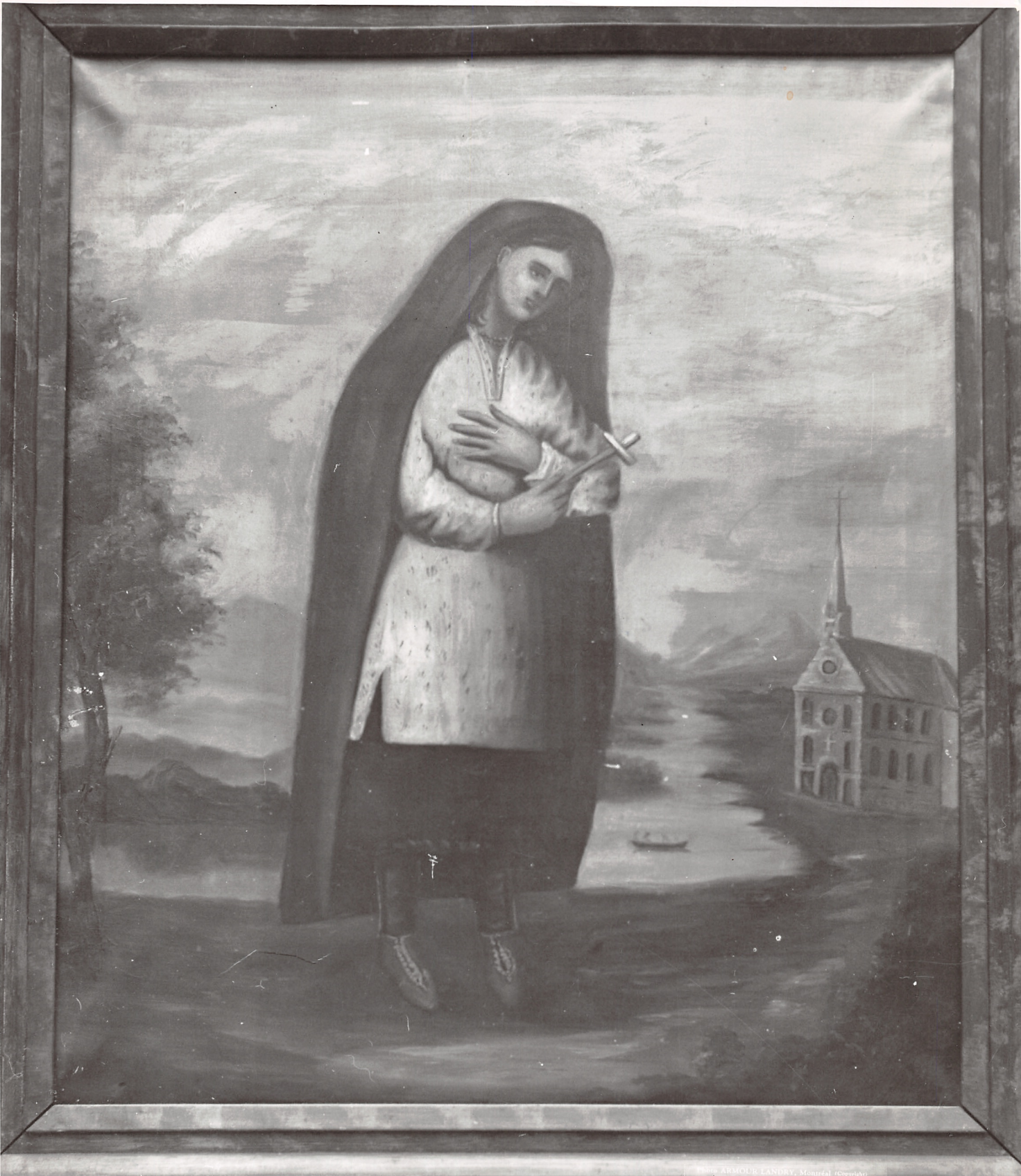
1890 ARMOUR LANTIER, Montreal (Canada)