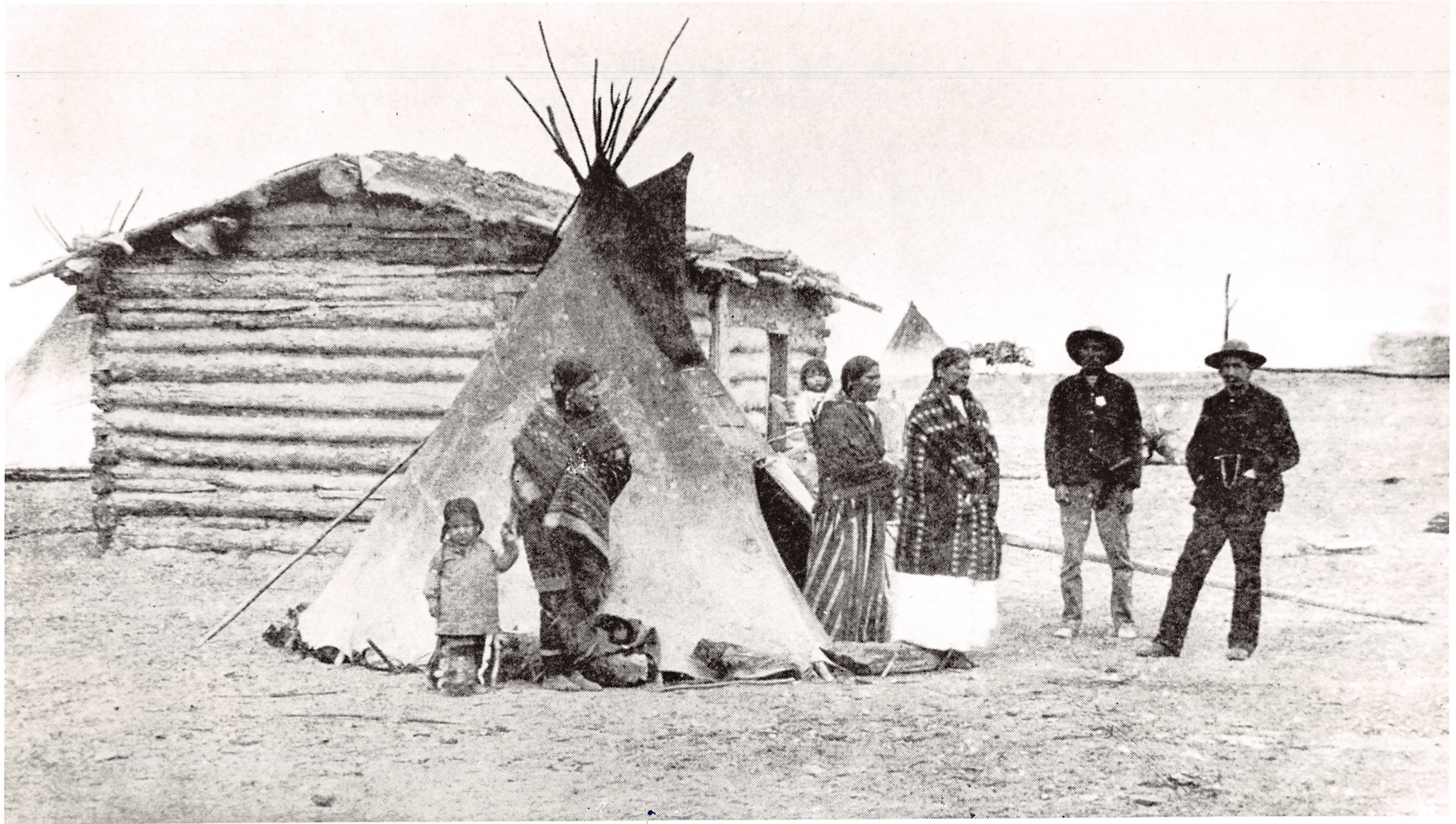
LOG CABIN AND TIPI OF A SIOUX POLICEMAN ON PINE RIDGE RESERVATION IN 1886