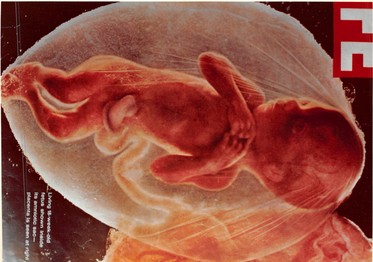
Living 18-week-old fetus shown inside its amniotic sac—placenta is seen at right