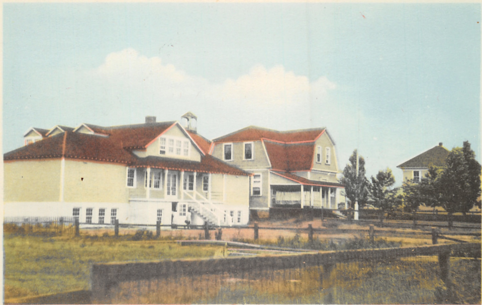
Restigouche—Ecole Indienne et le couvent des S. S. du St. Rosaire.—4.